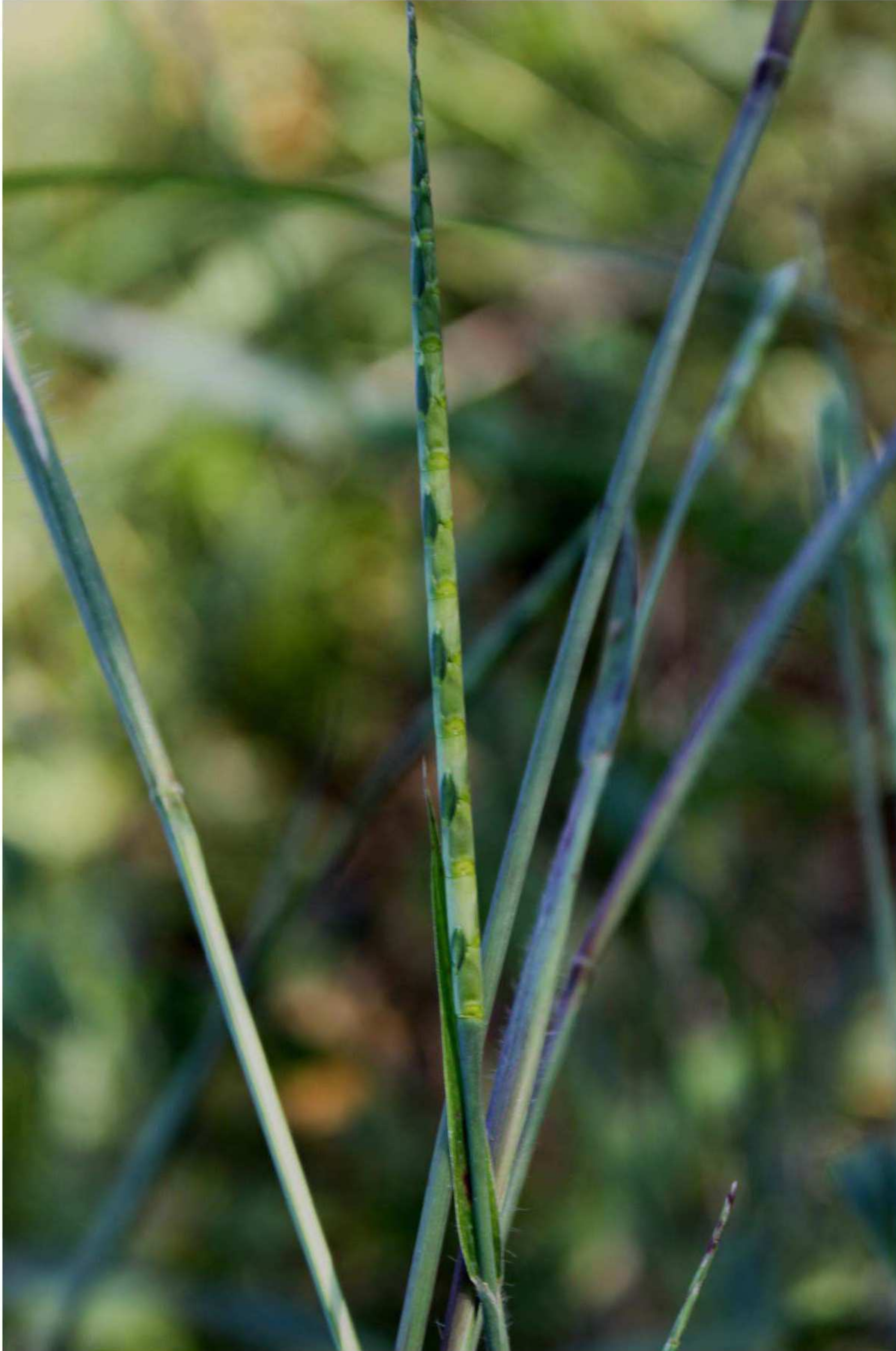
Figure 13. Rottboellia cochinchinensis (Poaceae).